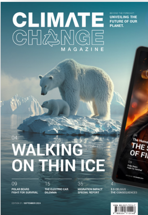
EDITION 01 SEPTEMBER 2024: WALKING ON THIN ICE

Climate change represents an unprecedented challenge, unparalleled in modern history. In a relatively short period, the last 250 years of industrialization and carbon emissions have significantly accelerated global warming, threatening human survival.